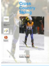
The Handbooks of Sports Medicine and Science : Cross Country Skiing