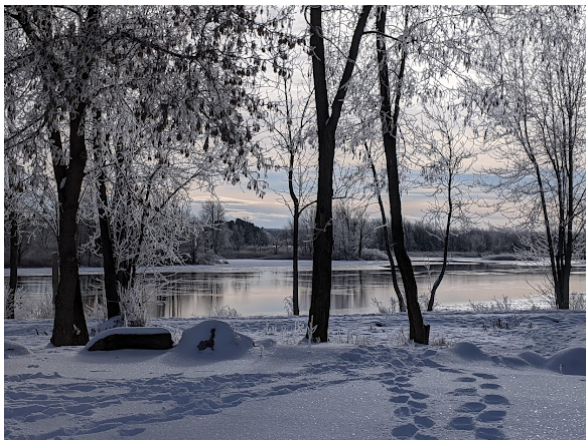
the view at the Munter trailhead