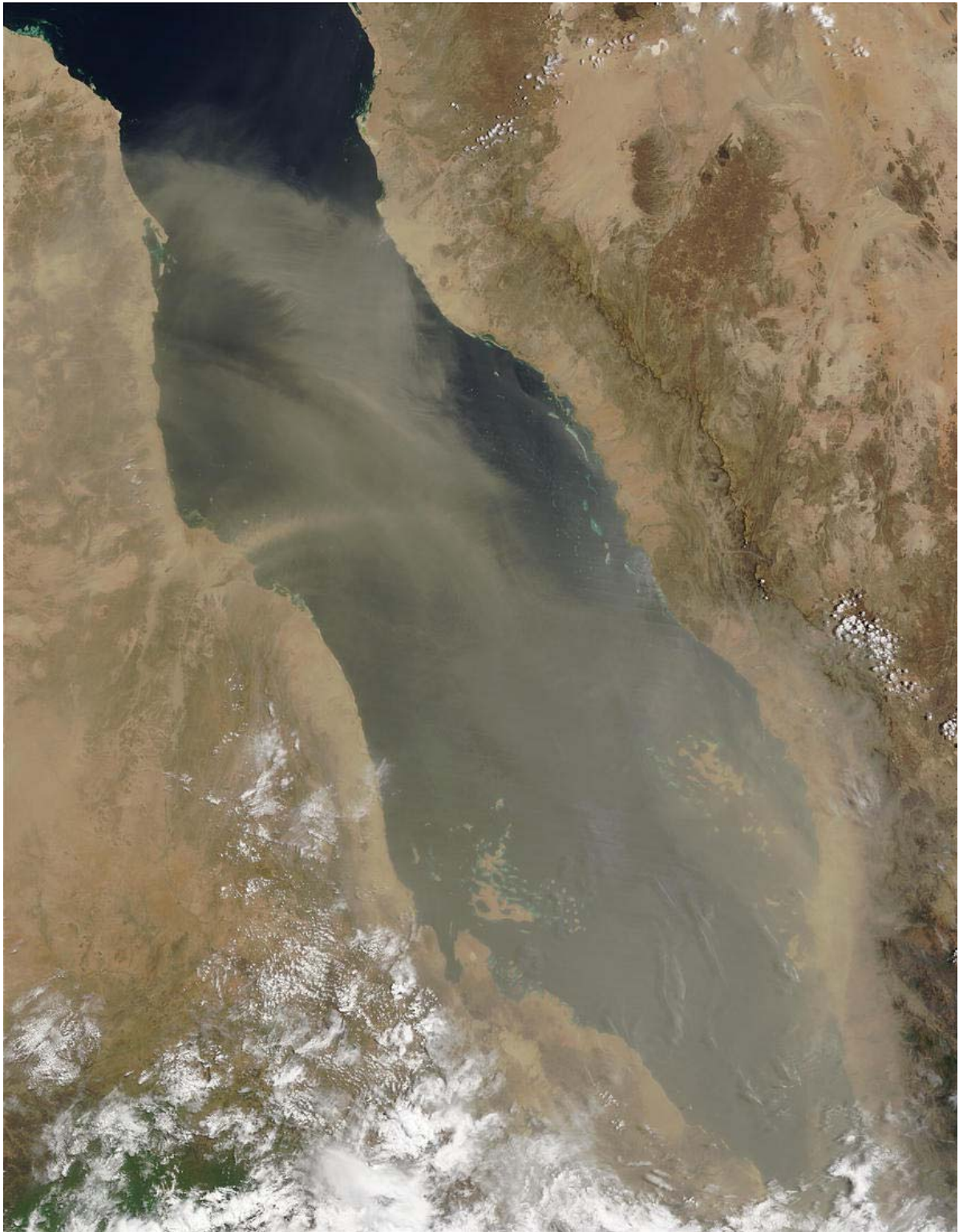
Dust storm over the red sea.