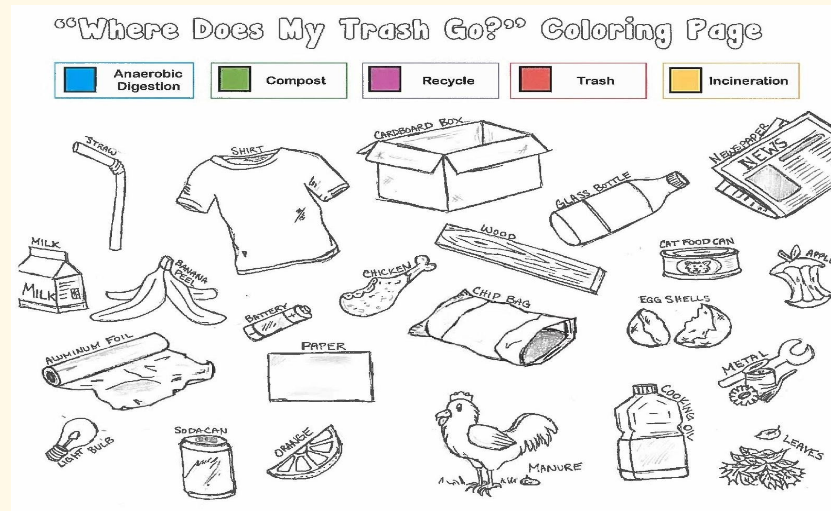
"Where Does My Trash Go?" coloring page

Students depending on their age and their teachers' interests could choose either the coloring page activity or BINGO. Each activity has the same objective. Also, the lesson plan is similar to each other. The interactive lesson is intended to keep the students engaged and highlights the importance of waste management.