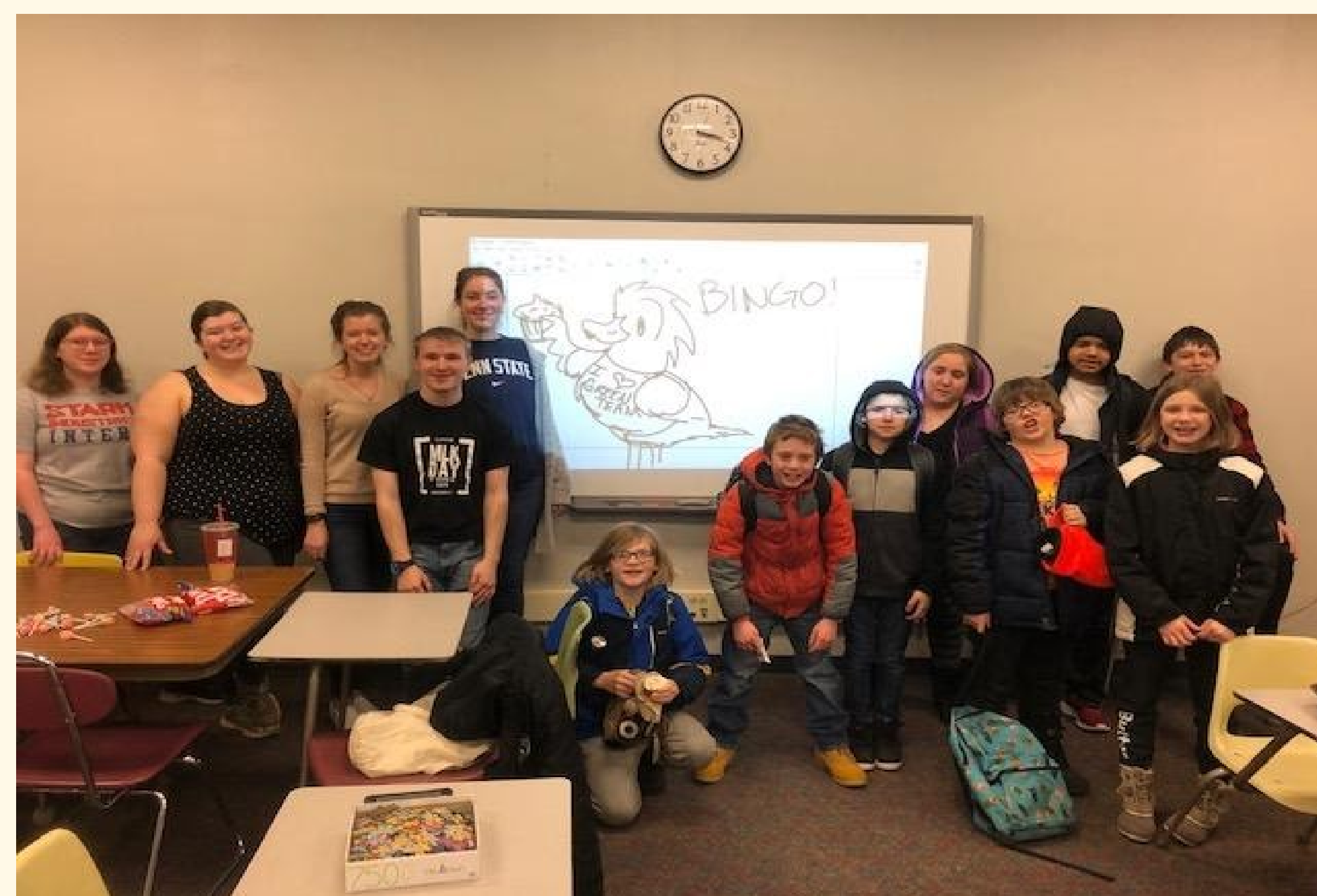
BINGO day participants